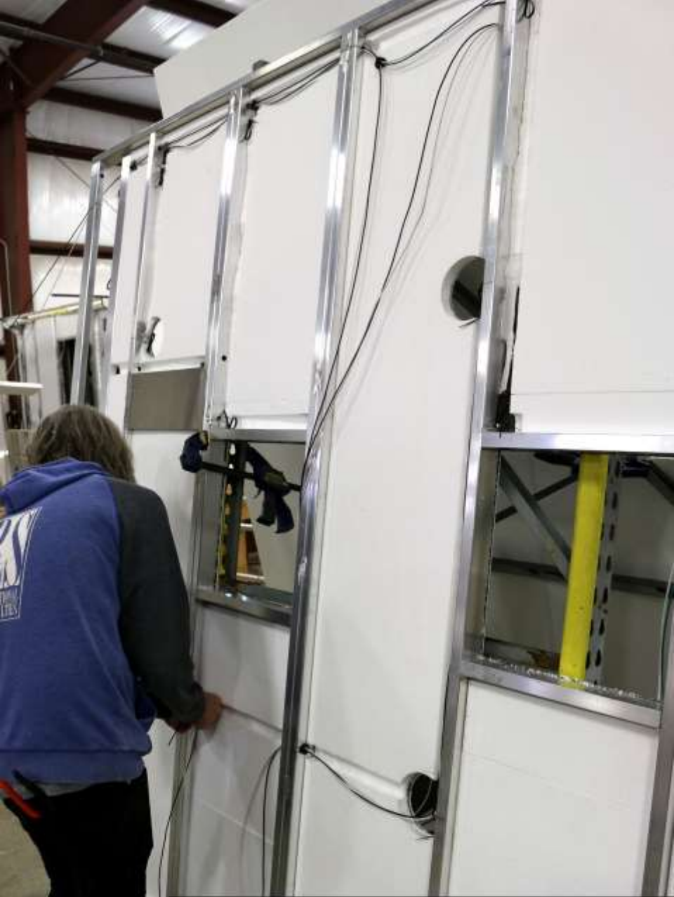
WIRING THE ROOF

Each individual piece of the structure is hand welded together, then stuffed with block foam insulation. The interior wall, ceiling boards, exterior sidewalls and roof are all backed with composite, not wood. Wiring is run through the structure, and it is ready to come together.